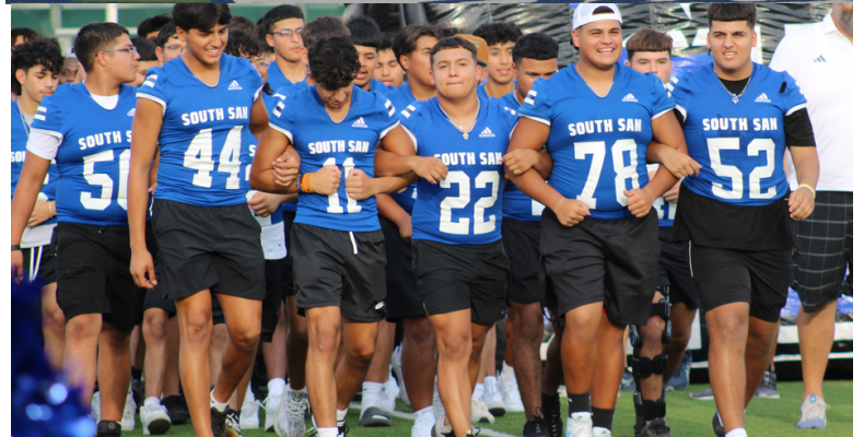
Multiple sports teams, cheer, dance, as well as clubs and organizations participate in Meet the Bobcats 2023.