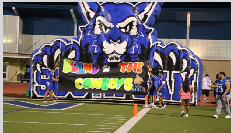
“Blind the Cowboys” banner tries to ignite our Bobcat’s energy.