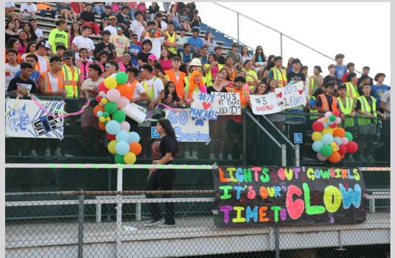
The Bobcat Student Section was loud and BRIGHT while cheering on our Bobcats.