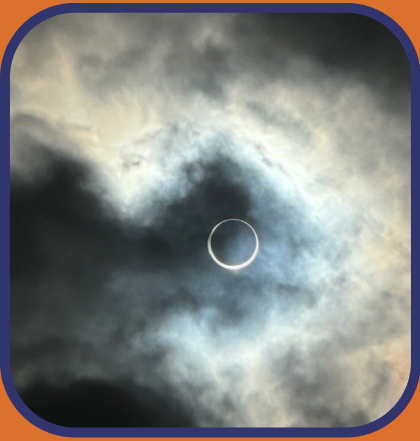
Image of the clouds passing in front of the eclipse.

On Oct 14, 2023 There was an annular solar eclipse that was visible across North, Central, and South America. Solar eclipses happen when the moon passes between the Sun and Earth, but because the moon is smaller than the sun, the sun is not completely covered. The corona, or the “ring of fire”, is the part of the sun that wasn't covered by the moon. Even though the eclipse's path went through San Antonio allowing for many people to see, it is never safe to look directly at the eclipse without wearing specialized eye protection such as eclipse glasses. You can also use a pinhole projector to view the eclipse indirectly. Many San Antonians and Bobcats enjoyed this rare phenomenon.