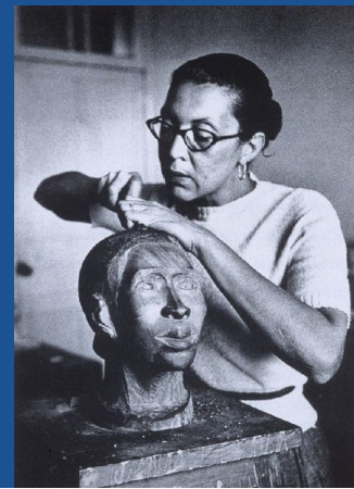
Elizabeth Catlett- African American sculptor known for sculpting the black American experience in the 20th century.