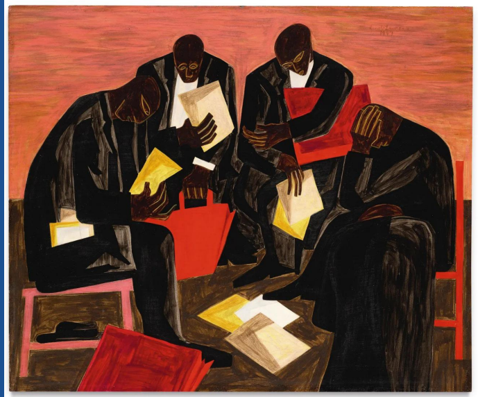
Jacob Armstead Lawrence -American painter known for portrayal of African American historical subjects.