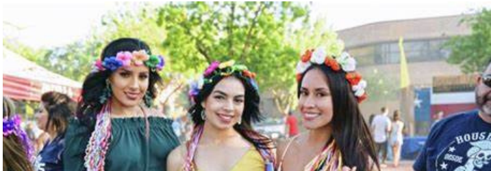
People at the 2024 Oyster Bake April 19, 2024

This event will be held in Alamo Heights and contains food from 80-100 booths with live music from the band Hot Cakes!