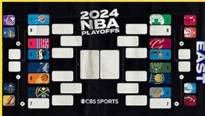
Official NBA Post Season Playoffs 2024