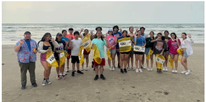
Interact Club and NHS students work together at Malaquite Beach Clean Up, April 20, 2024.