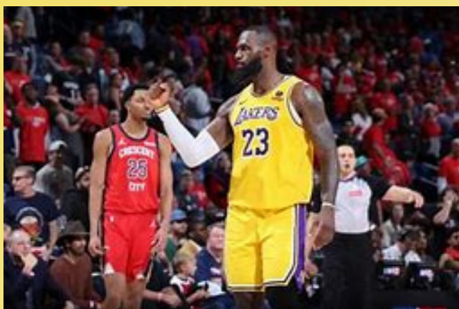
Las Angeles Lakers vs New Orleans Pelicans 4/16/24