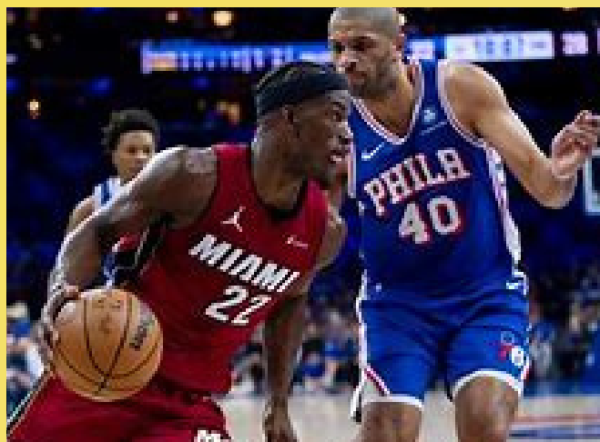
Philadelphia 76ers vs Miami Heat 4/17/24