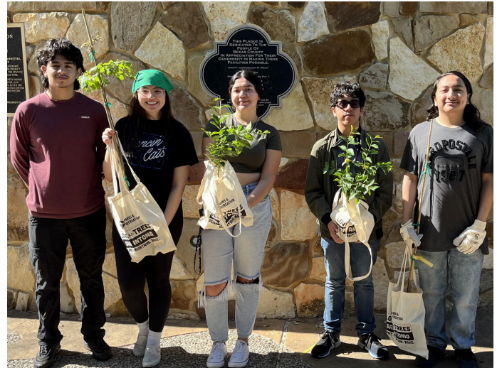
South San's Interact Club at Conception Park giving away trees on April 13th