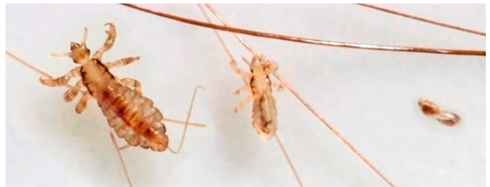
Head lice at various stages of development from egg to adult.

NO. Anyone can get head lice and personal hygiene does not influence who gets them.