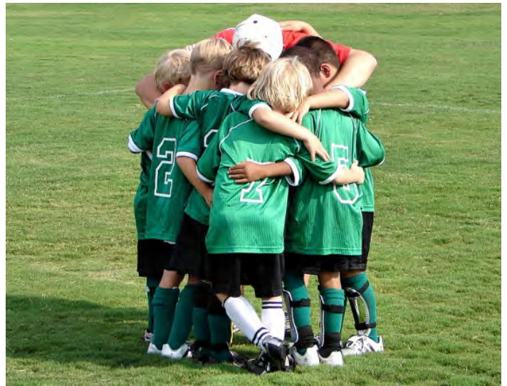
Kids huddle before a game.

Pyrethrins are naturally occurring chemicals that can kill insects. Although mild, pyrethrins can be irritating to humans, especially sensitive individuals. Research suggests