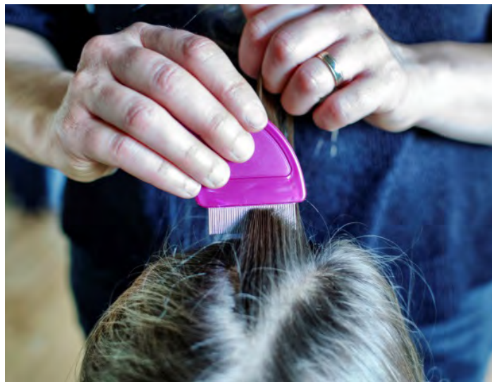
A mother combing a child's head and checking for head lice.

It is best to use a head lice comb to monitor other members of your family for head lice and only treat if someone is found to have an active infestation. Before using a comb on different family members, it is best to clean the comb with isopropyl alcohol, or warm, soapy water.