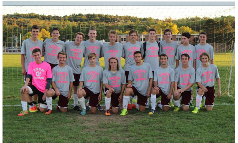
(Above) The boys' soccer team showing their support for breast cancer awareness.