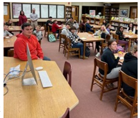
Middle School Student of the Month Awards Breakfast