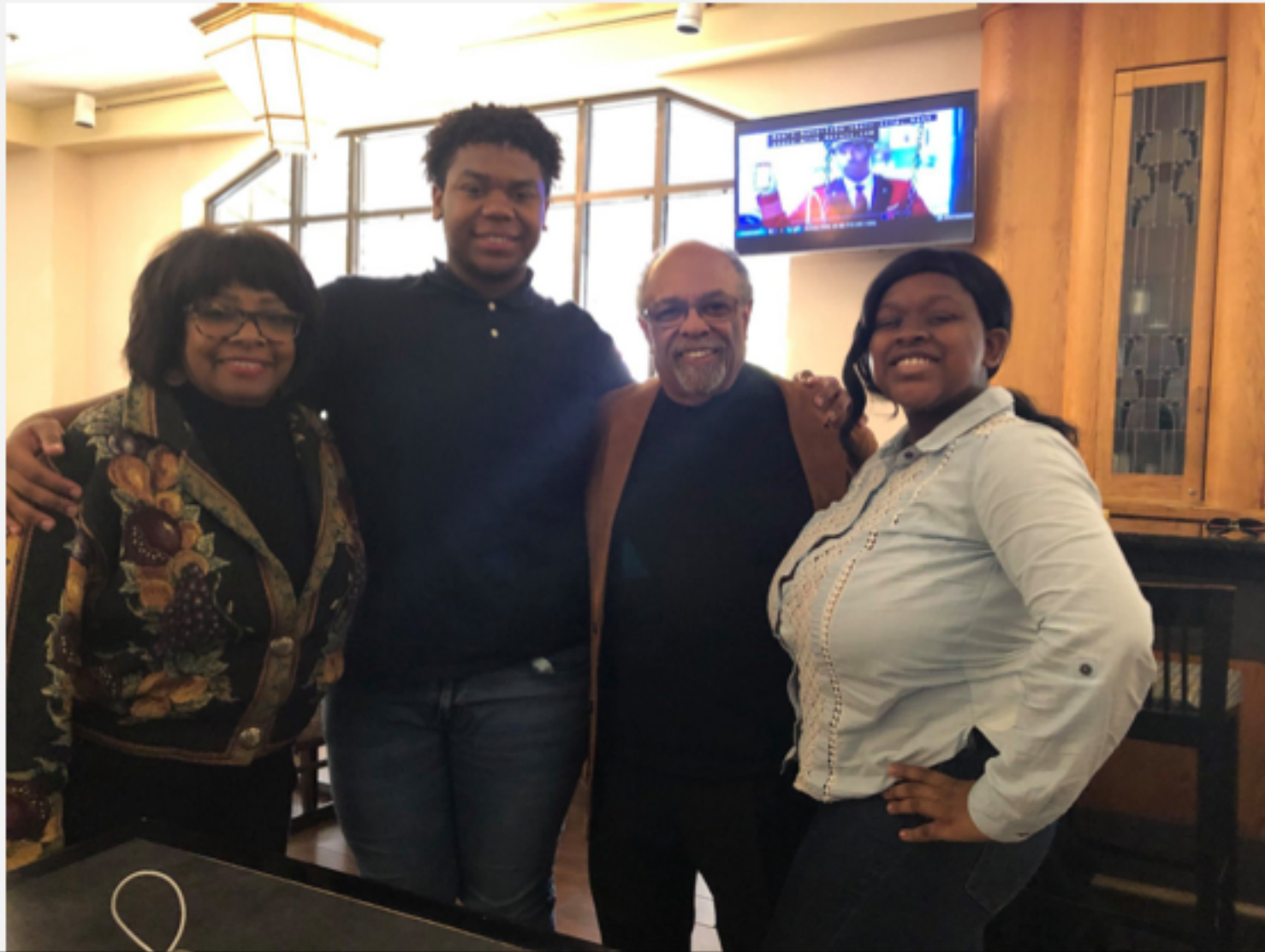
MENTOR TO CAPA GRADUATE TONY AWARD WINNER, BILLY PORTER