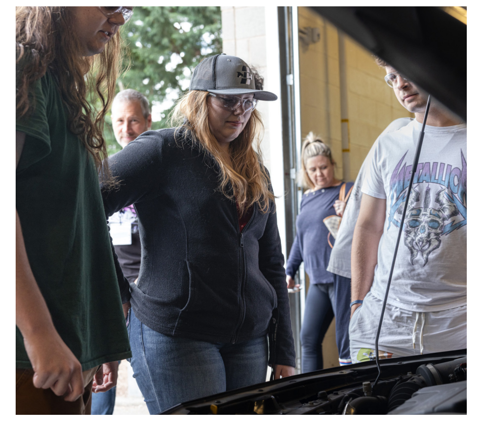
Puyallup High School Auto Tech Students observe cars donated from Toyota of Puyallup.

Thank you, Toyota of Puyallup, for giving our students a boost in the classroom!