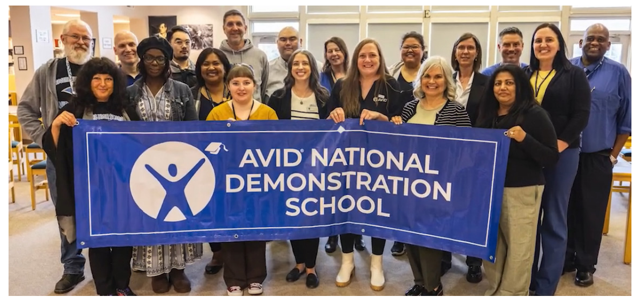
Rogers High School students and staff proudly display their AVID National Demonstration School sign, celebrating their top 1 percent achievement in the AVID program.