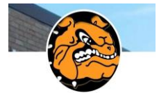
Maltby PTO @MaltbyPTO