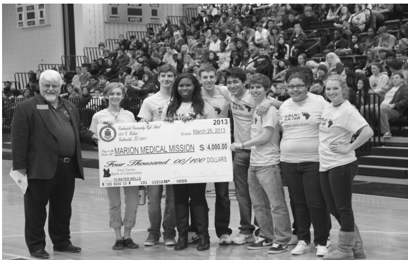
Several CCHS students involved in the Walk to Water project present a check to Marion Medical Mission to help build wells in Africa.

The project was featured by WSIL TV-3, The Southern Illinoian , the Marion Medical Mission newsletter, the Illinois Heartland Library System newsletter, and in the CCHS application for the Democracy School Award.