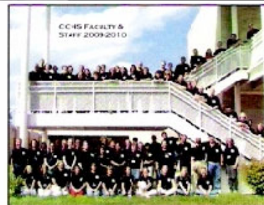
On the right, the 2009-2010 CCCHS Faculty and Staff display their Terrier pride.