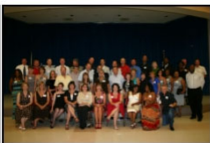
CCHS class of 1979 at their 30th reunion.