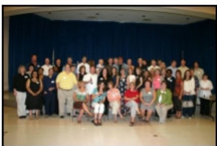
CCHS class of 1980 at their 30th reunion.