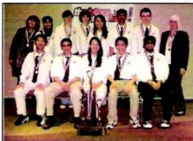
On the left, our 2008-2009 IHSA State Scholar Bowl Champions celebrate their victory and proudly display their trophy.

Those desiring to put forward the names of individuals for these recognitions can submit nominations to the superintendent's Administrative Office. Forms for this purpose can be obtained from the Office at 330 S. Giant City Road in Carbondale (618) 457-4722. Forms can also be obtained by going to http://cchsterriers.com/ and clicking on Hall of Achievement.