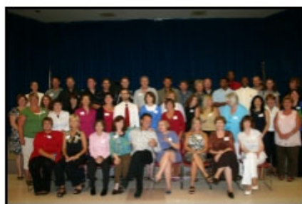
CCHS class of 1978 at their 30th reunion.

If any class needs help getting started on their reunion, please go to the alumni website. Class rosters can also be requested by emailing webmaster@cchsterriers.com .