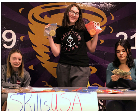
SkillsUSA members sell baked goods at the school to raise money for their community service project.