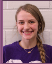
"Olive Garden" -Emily Foster