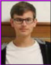
"Turkey" -Andrew Roush