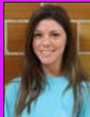
"Turkey and Green Bean Casserole" -Destiny Smith