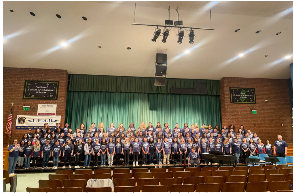
Students from all over Bergen County performed together at the festival in Fair Lawn.

Music Educators of Bergen County, Inc. sponsored their annual Fifth and Sixth Grade Treble Choir Festival at Memorial Middle School in Fair Lawn on April 20th. Each school in the county was able to nominate up to 8 students to participate in the festival, which culminated with an afternoon concert.