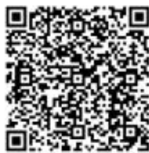
HIB Model Language