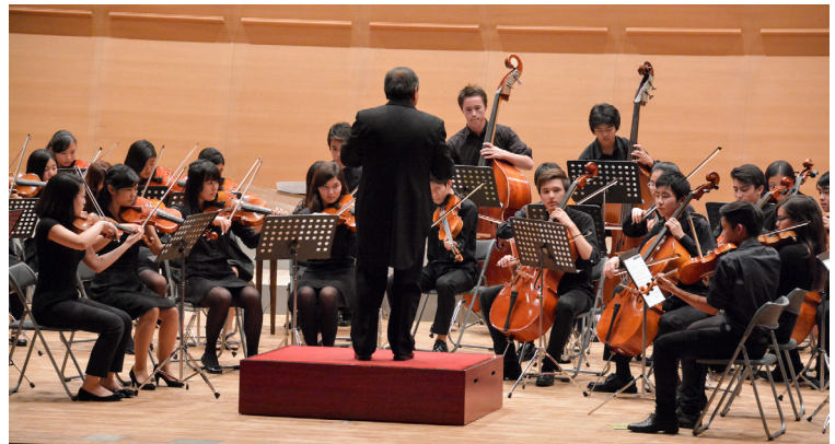
Maple Hall Concert

Within the MYP curriculum, OIS students in grades 7-10 share the physical education, music and visual arts classes with students from SIS. Most of the classes are in English, but some content will be in Japanese. The program actively encourages bilingualism and provides support for monolingual students. Because of the shared program status, the three subjects are at the center of our schools and are developed to a high level.