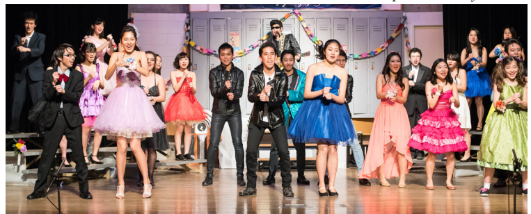
School production of 'Grease'