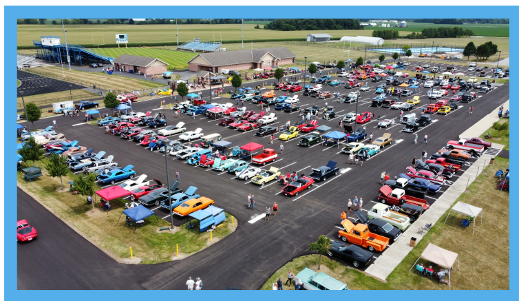
2024 RV Athletic Boosters 4th Annual Car Show