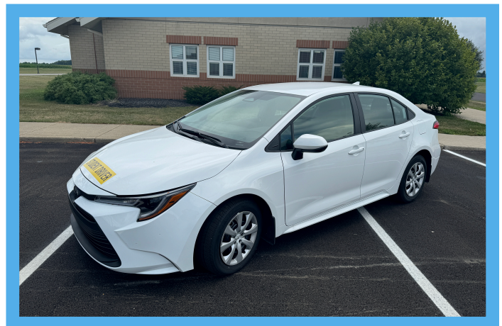
New driver's education vehicle provided through State of Ohio grant funding.