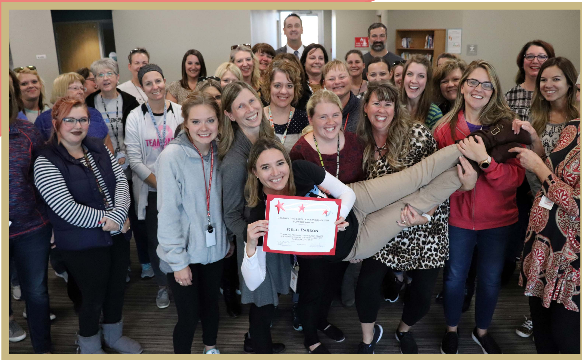
Due to COVID precautions, we were not able to celebrate staff in person this year, but this is one of our favorite photos from past surprises.

Each year, district and building leaders honor individuals throughout the district for the amazing work they do for the district and its mission of connecting, learning, and leading .