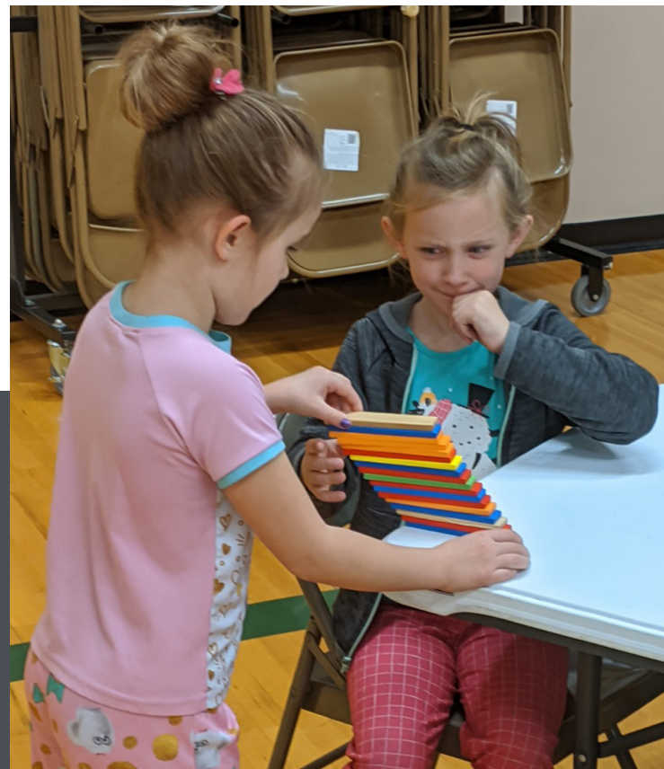
MES students develop critical thinking and teamwork skills through engineering activities.

In response to this area of need, the Foundation has set a goal of securing funding to ensure that students in each of our 5 elementary schools has access to the same resources in their school STEAM labs.