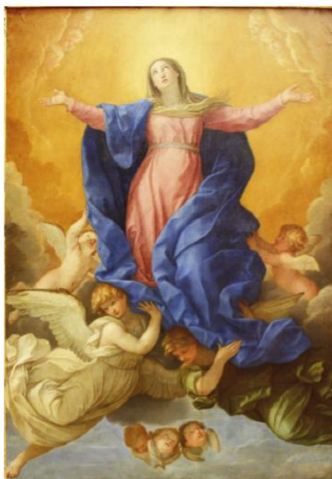
The Assumption of Virgin Mary by Guido Reni