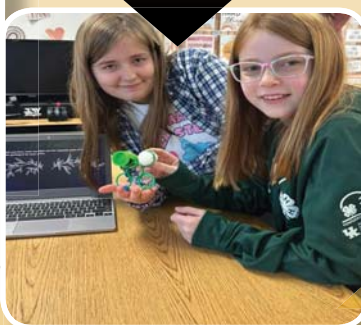
They then created their own fidget using the MakerSpace in the Innovation Lab.