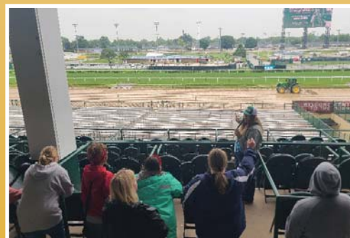
Pre-Employment Transition students visited Churchill Downs to learn about opportunities such as groundskeeping, horse trainer, jockey, concessions, tourism, and working in the equine industry.

Our commitment to preparing high schoolers for their future endeavors extends beyond the classroom, ensuring they are equipped to pursue their passions with confidence and competence. With a comprehensive curriculum that enables students to graduate with substantial college credit, they have a solid foundation for higher education, providing them with flexibility and opportunities for academic exploration. Additionally, through our pre-employment transition program, students engage in a multifaceted learning experience that encompasses job exploration counseling, work-based learning, workplace readiness training, post-secondary counseling, and instruction in self-advocacy. From career counseling and job search assistance to internships and on-the-job training, students gain valuable insights into various career pathways and develop essential skills for success in the workforce. We empower our students to pursue their passion, whether they choose to further their education or enter the professional realm, with the tools and confidence needed to thrive in any endeavor.