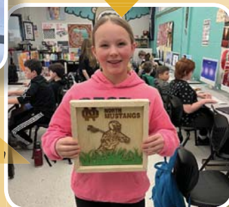
Not only do they learn how to use 21st century software and equipment, they also tackle complex problems with innovation, collaboration and emotional intelligence.

This year, 1665 OCS students took a total of 3897 AP exams. While scores for this year's tests aren't in yet, last year, 70% of exams taken by OCS students received a passing score, which outperforms the state and global average! Additionally, OCS students have amassed a significant number of dual-credit hours throughout their high school years. Together, they have accumulated 9,063 college credit hours, allowing them to begin their college careers with credits already earned.