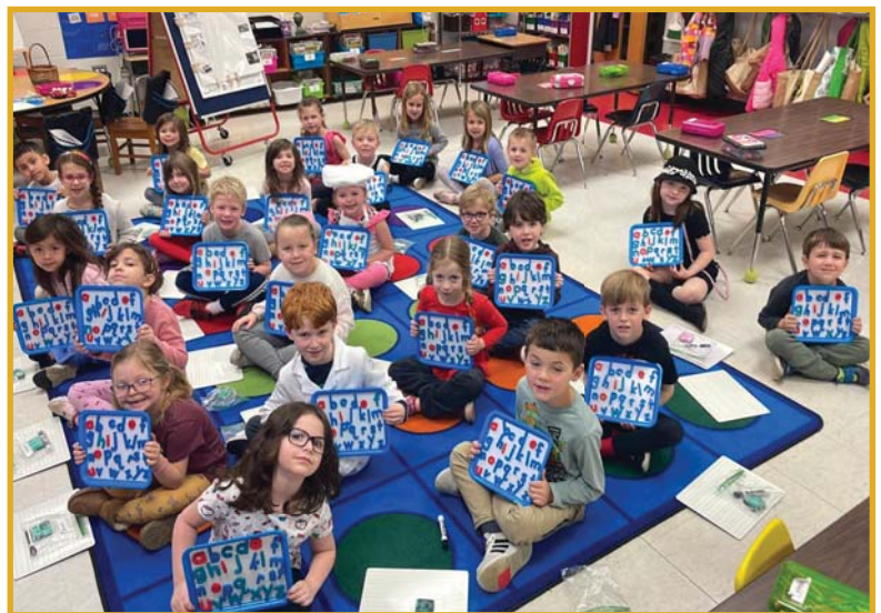
These Goshen kindergarteners are proud to show off that they've mastered all 26 letters!