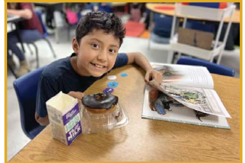
Crestwood students learned from a virtual visit with an author, read together and then took the books home to share with their families. They were so excited to share that they were pulling them out of their backpacks in the car rider line!