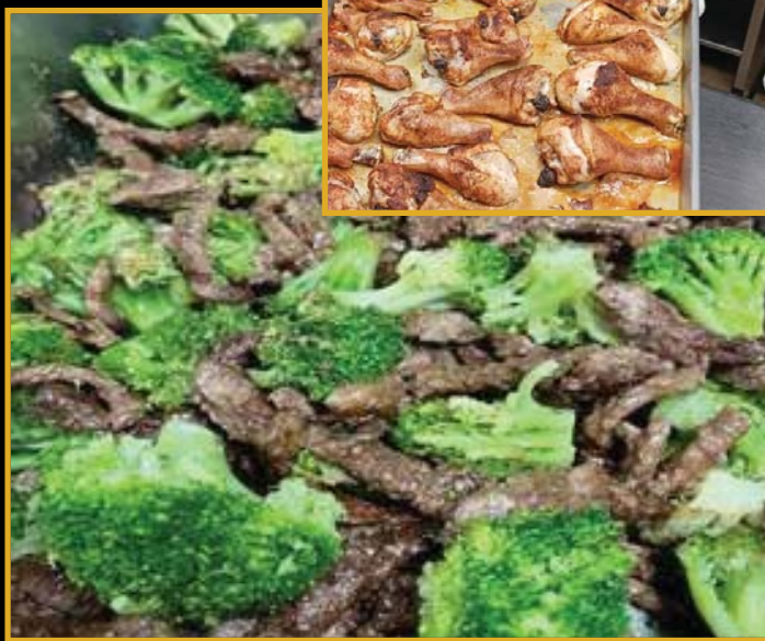
Chuck roast, beef and vegetables from Brenneman and Bucks Farm