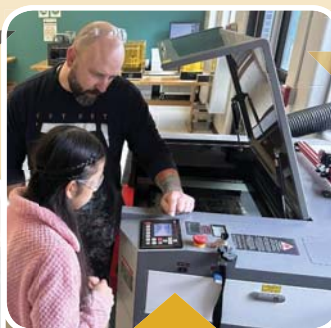
Students develop competencies in critical thinking and problem solving in the NOMS innovation lab.