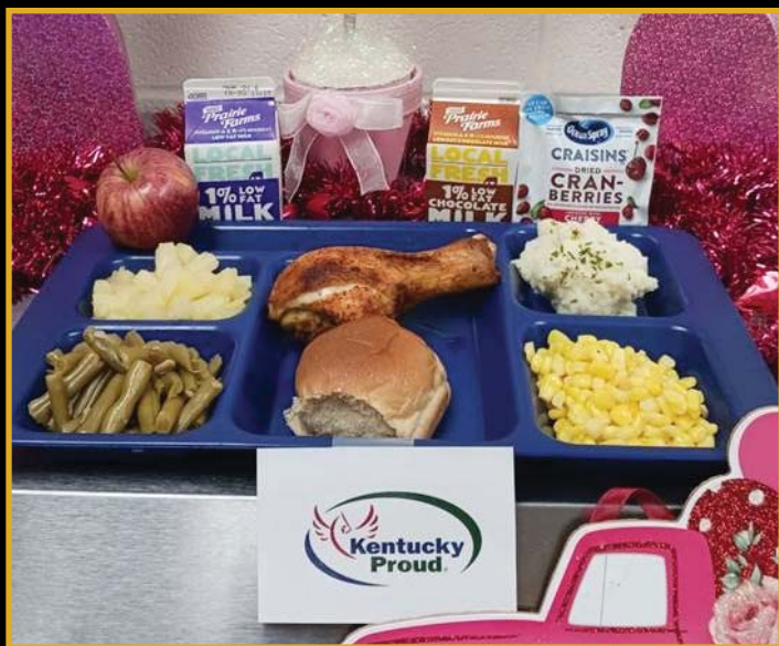
Smoked chicken and pork from Faul Family Riverside Farm