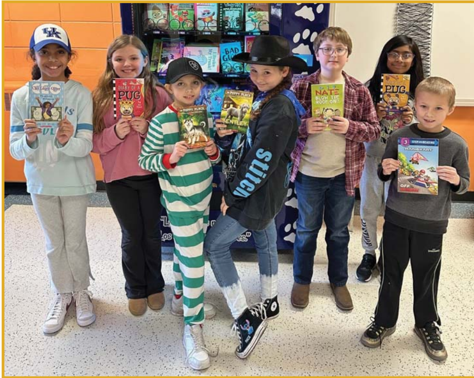
During the 23/24 school year, La Grange Elementary highlighted the importance of literacy by giving away over 1500 books from their PTA-sponsored Book Vending Machine (Book Box). Students earned tokens by demonstrating monthly character traits, following library expectations, and cashing in classroom rewards.

Oldham County Schools is dedicated to promoting a strong reading culture among our K-5 students through an evidence-based curriculum to ensure their success. Our comprehensive literacy approach includes phonics, comprehension, and vocabulary strategies, ensuring students become proficient readers and laying a solid foundation for their academic future. Collaboration among educators, administrators, and families creates supportive environments where reading flourishes, empowering every student to reach their full potential and excel academically.