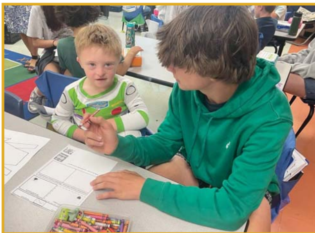
Writing letters and having a penpal is a fun and effective way to improve literacy skills. This year, Harmony Elementary students have been penpals with students at North Oldham Middle School. They loved getting together to read their mail and write responses.