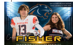
Sample PLAYER PAGE