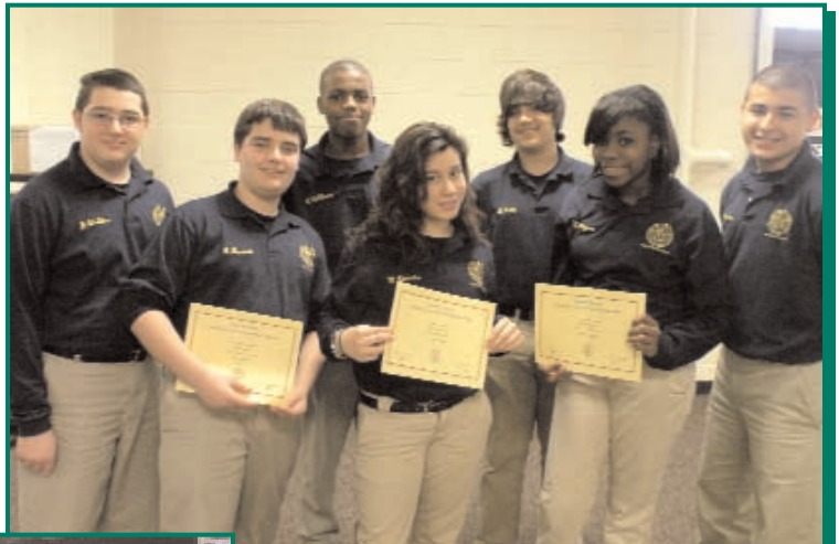
Law and Public Safety Students