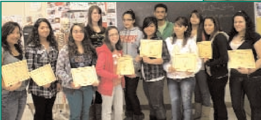
Health Occupations Students

For more information call 908-526-8900, ext. 7154.