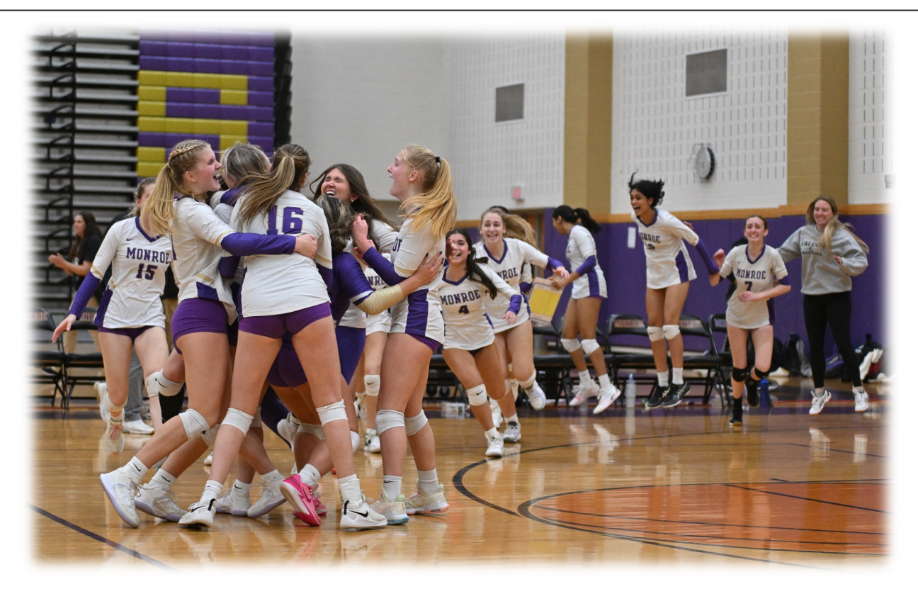
Monroe Township High School | Varsity Girls Volleyball NJSIAA Sectional Champions*