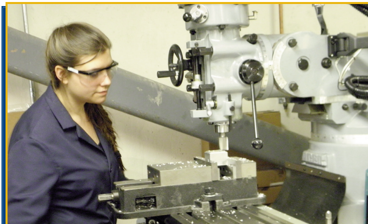
(left to right): Beginning in September 2016, Somerset County Vocational & Technical High School (SCVTHS) will be offering a new program in Mechatronics, Engineering and Advanced Manufacturing (MEAM).

First Place Winner - Newsletter Category