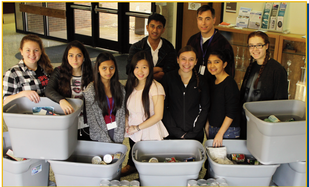
Members of the SCVTHS Sophomore class pose with donated food items.