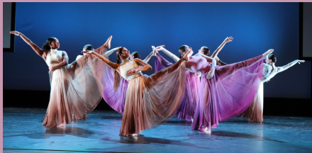
"There I Go Rising" by Caitlin Eswein