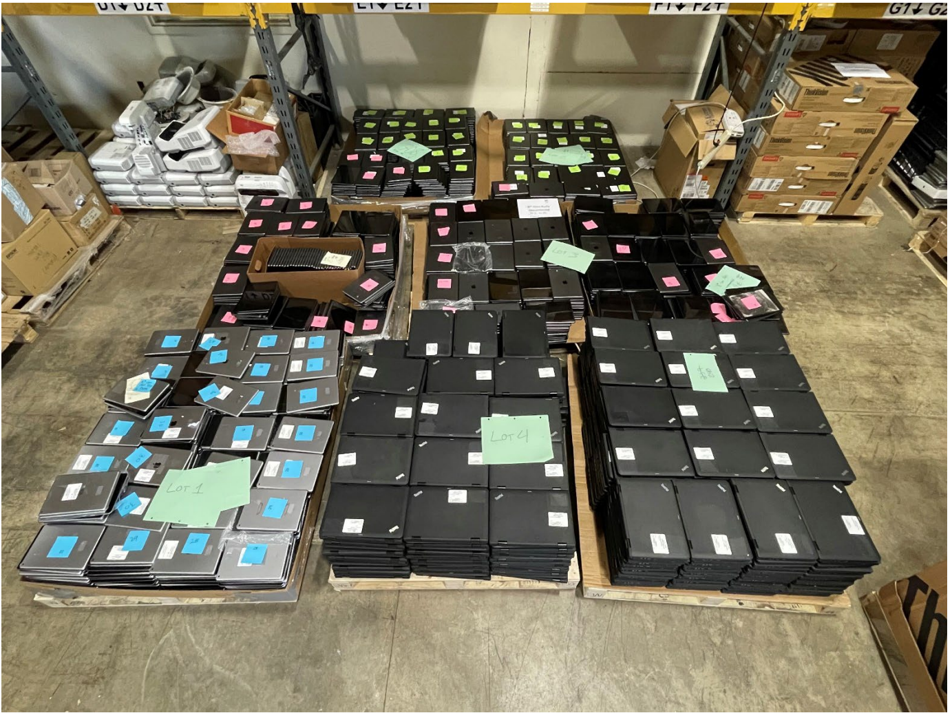
Pictured: All four lots