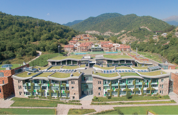
UWC Dilijan Campus