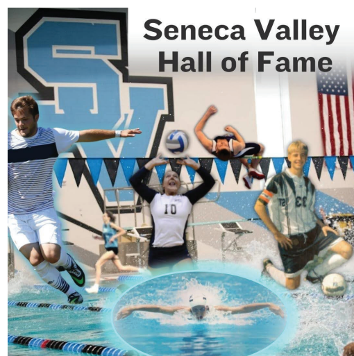
Seneca Valley Hall of Fame