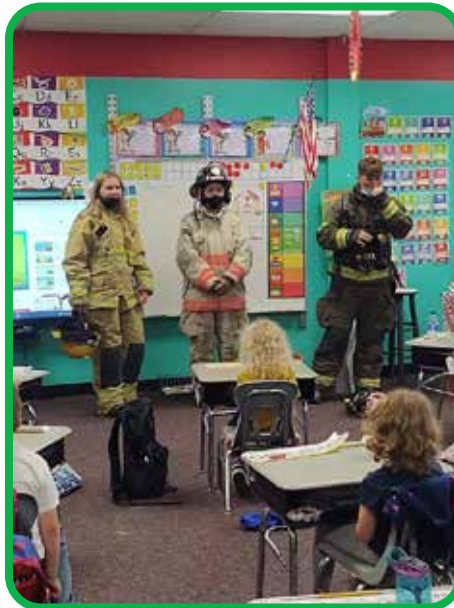
Fire Safety Week was October 4-7 this year. Our student firefighters came into elementary classrooms to show students how to plan ahead to be safe if a fire ever happened at their home.