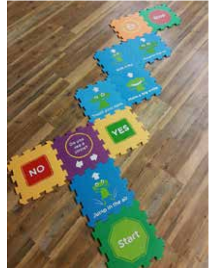
PK4 students learn coding!

STEAM in the Library began in September. Grades K-3 had a deep dive into butterflies, exploring the cocoons they have been watching with Mrs. Norasetaporn and observing the resulting butterflies! Students explored life cycles and butterfly parts and even did some coding with color! Grades 4-6 completed FlipGrid activities from Rick Riordan, author of the Percy Jackson series. Students put their writing hats on and brainstormed how to use different objects and art as inspiration for writing.