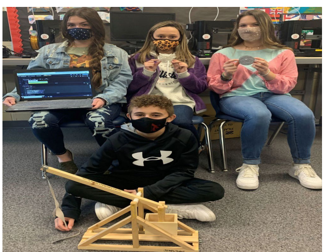
Appling County Elementary School