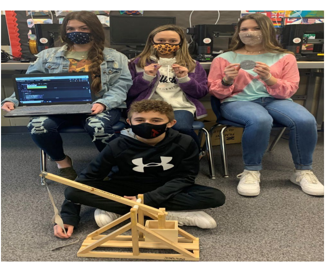
Escuela Intermedia del Condado de Appling