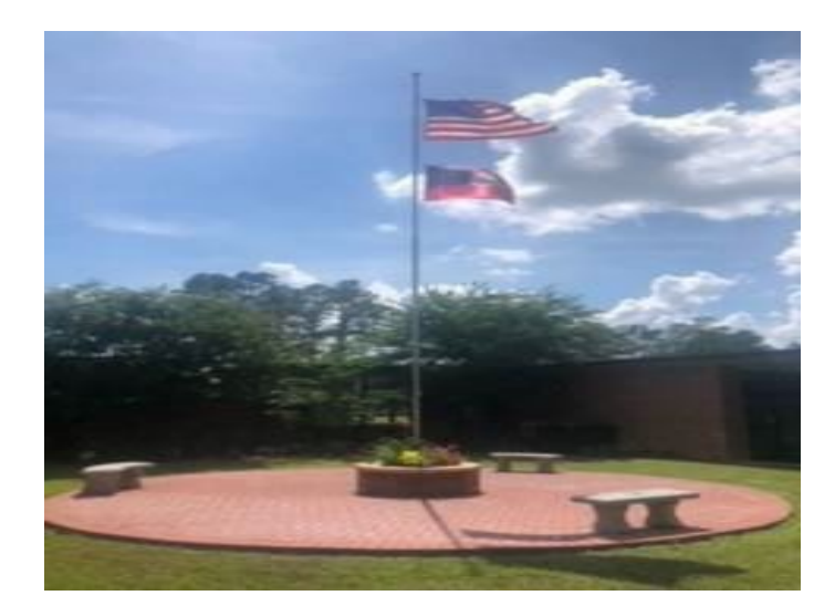
Appling County Primary School Fourth District Elementary School