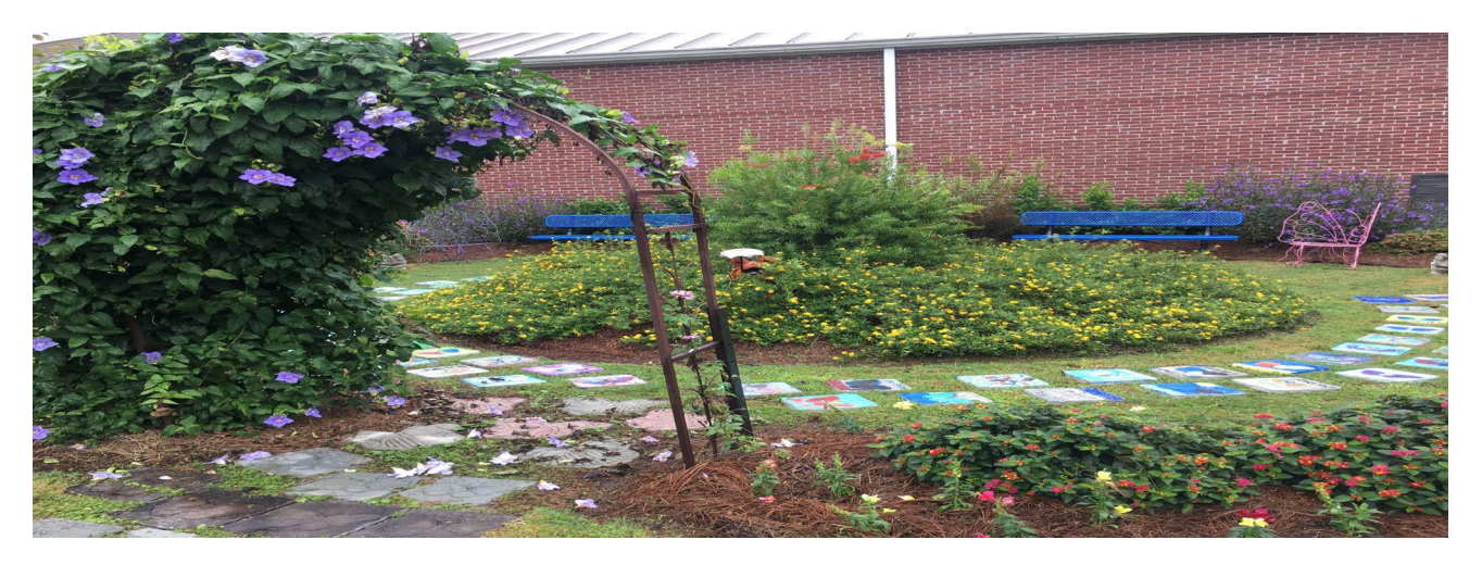
Altamaha Elementary School