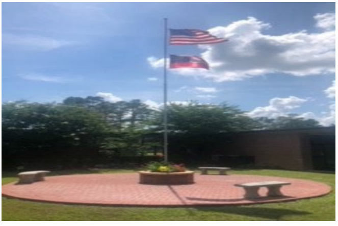
Escuela Primaria del Condado de Appling