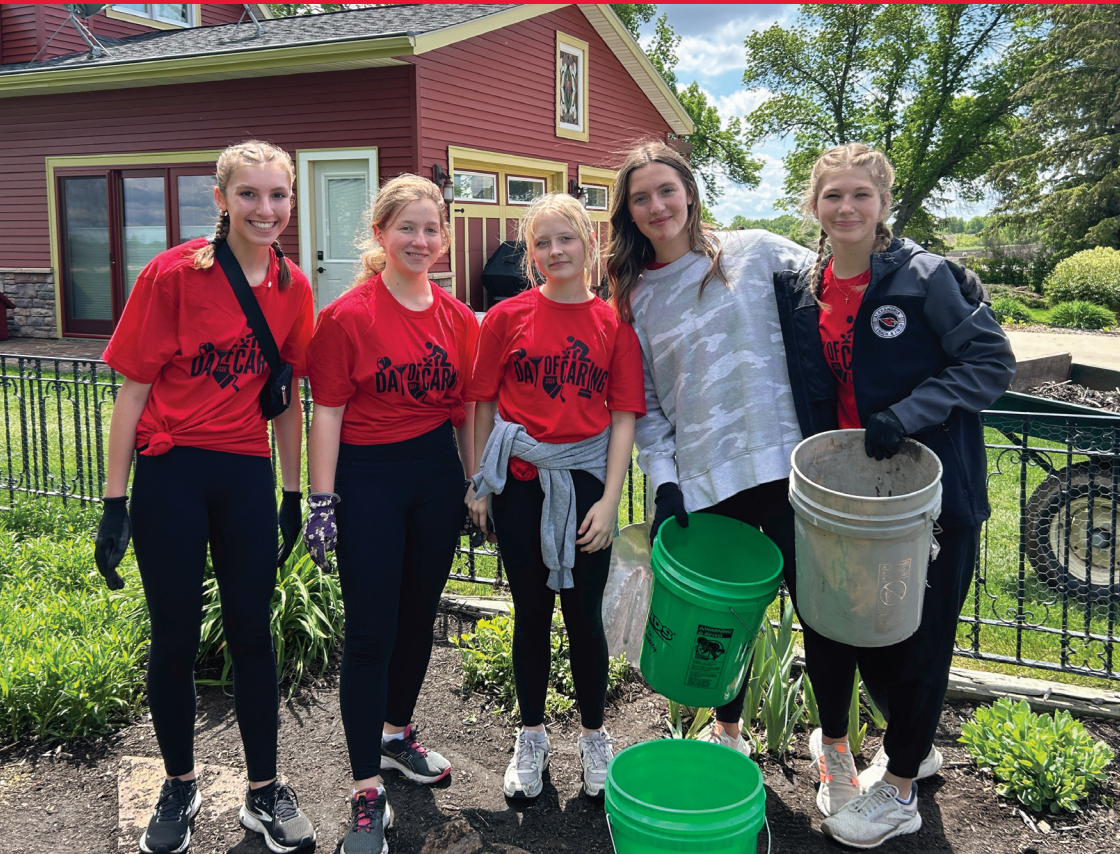
Discovery Middle School (DMS) unites students transitioning from elementary level grades into our grade 6-8 Alexandria Cardinal middle school community. Annually, 8th grade students team up with United Way of Douglas & Pope Counties to work at community sites cleaning up yards, gardens and homes for those who need a little extra help.