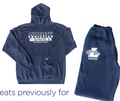
Athletic sweats previously for 6th-12th grade