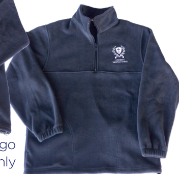
Quarter-zip fleece with crest logo