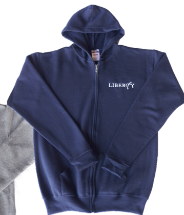
Zip-front hooded sweatshirt with Liberty logo previously for K-5th grades.