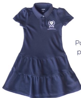
Polo Dress with crest logo previously for K-2nd grades only.

Due to logo updates on new outerwear, the following items will no longer be sold in the Liberty Locker and are no longer compliant under the current uniform policy.