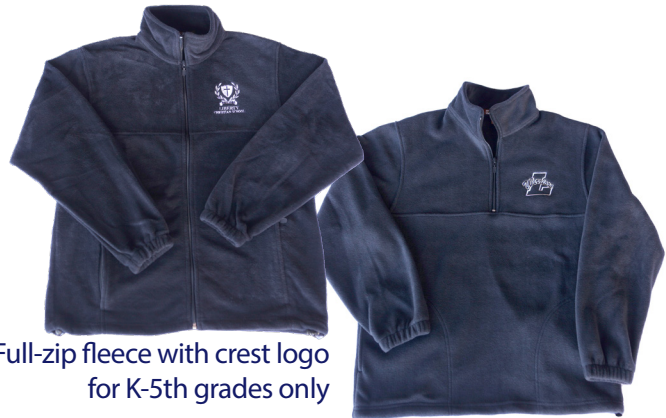
Full-zip fleece with crest logo for K-5th grades only