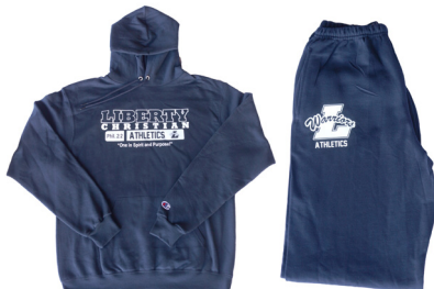
Athletic sweats for 6th-12th grade