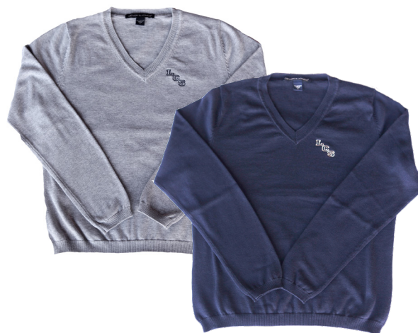
V-neck sweaters previously for 6th-12th grade