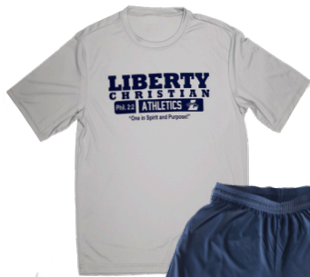
Athletic wear for 6th-12th grade