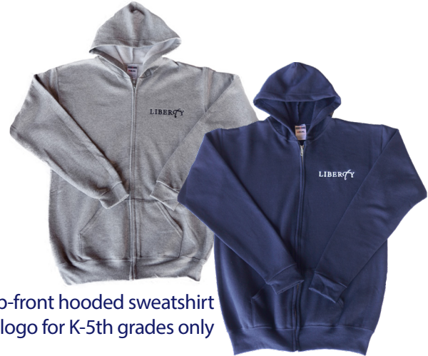
Zip-front hooded sweatshirt with Liberty logo for K-5th grades only