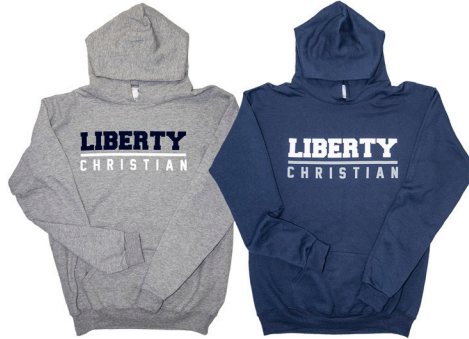
Hooded sweatshirt allowed on Jeans Days only