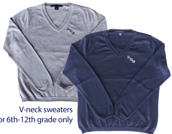
V-neck sweaters for 6th-12th grade only