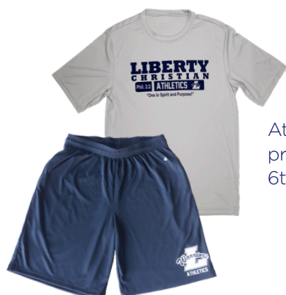
Athletic wear previously for 6th-12th grade