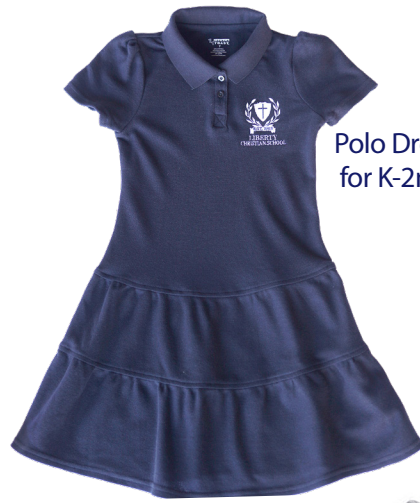
Polo Dress with crest logo for K-2nd grades only

Please note: Hooded sweatshirts (not pictured) are being discontinued, but will be allowed on Jeans Days only for the 2024-2025 school year.