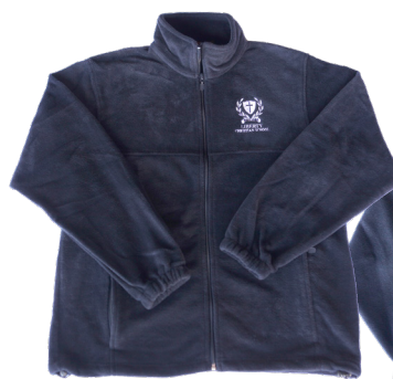
Full-zip fleece with crest logo previously for K-5th grades only