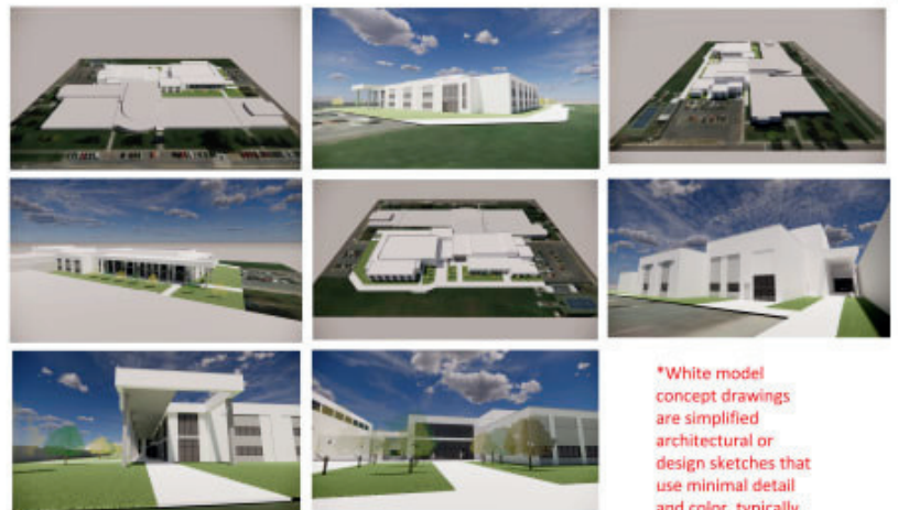
DRAFT 6.24.2024 - Subject to Modifications

*White model concept drawings are simplified architectural or design sketches that use minimal detail and color, typically in shades of white, to convey the basic form and structure of a concept.