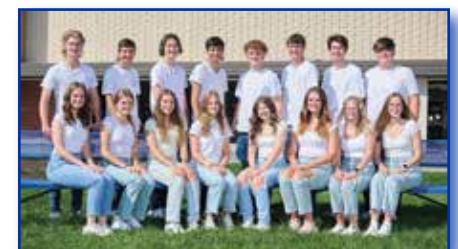
Above, the Homecoming Court poses before the game in front of the high school. At left, the king and queen acknowledge the cheers from the crowd.