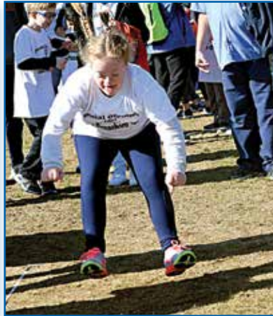
Fifty Lower Dauphin athletes competed in the annual Fall Special Olympics at East Pennsboro High School.