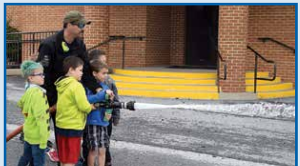
Firefighters from across Lower Dauphin visited elementary schools to talk about fire safety.