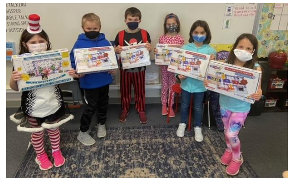
Snap Circuit Kits, Cangialosi's 2 nd grade class, East Hanover, 2021