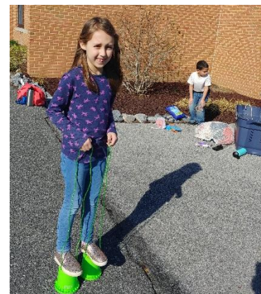
After School Play Program, Londonderry, 2020