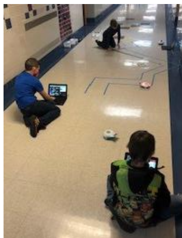
Finch Robot 2.0, Weary's 4 th grade class, Londonderry, 2021

This past year, the Foundation awarded 8 new grants benefitting students across all grade levels. This makes a total of 169 grants during the past 13 years. These grants support innovative programs and projects to assist our students in achieving their goals in academics, the arts, community service and athletics. For more information regarding the grants allocated this past year or to view our annual report, please visit our website at ldfalconfoundation.org .