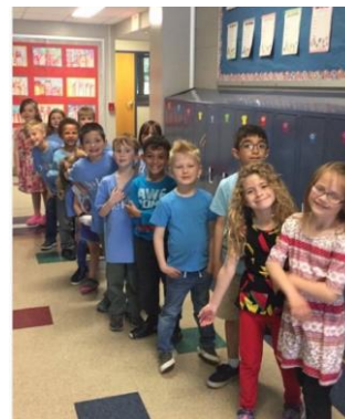
Composting with Kindergarten, Adams K class, Nye, 2019