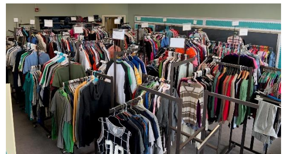
Kid2Kid Clothing Bank, Price Building, 2021