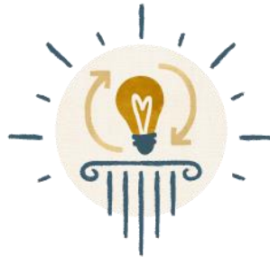
ONGOING PROFESSIONAL GROWTH