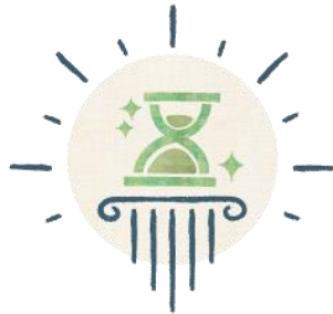
EXPLICIT INSTRUCTION, INTERVENTIONS, & EXTENSIONS