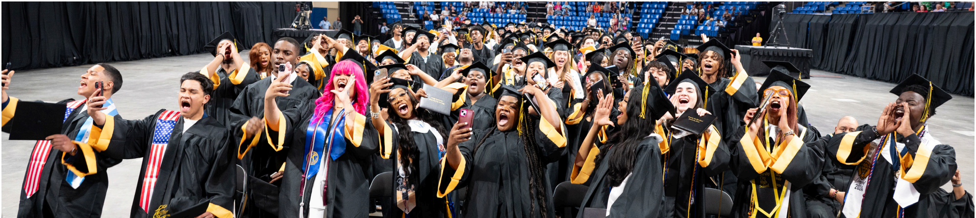
Family and friends look on as the UCHS Class of 2024 answers back to the iconic UCity question of “What time is it?!” with a resounding U-TIME!