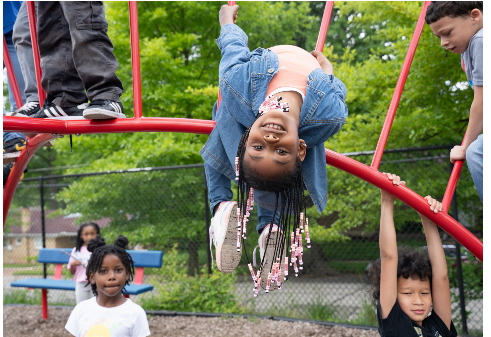
Work is underway on playground upgrades at Jackson Park and Pershing Elementary Schools.