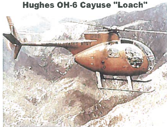
Hughes OH-6 Cayuse "Loach"