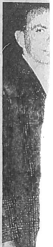
HONO right, g from le Laym