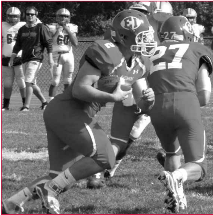
The Redmen were Suffolk County champions for the first time in seven years.

The middle school's girls soccer and volleyball teams both finished with undefeated seasons ; the girls tennis team was awarded the NYSPHSAA Section XI Sportsmanship Award .