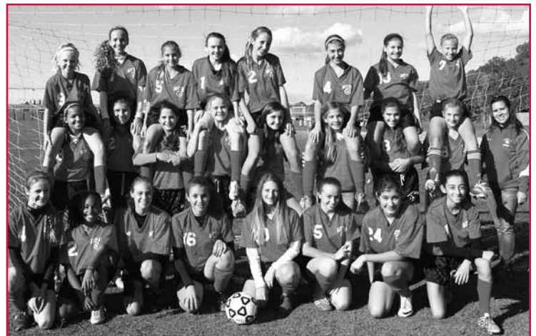
The middle school girls soccer team finished their season undefeated.

Seniors signed National Letters of Intent to play for top college athletic programs, including Syracuse University, University of Massachusetts Amherst, West Virginia University, New York Institute of Technology, Adelphi University, Binghamton University, Mercy College, Wingate University, Iona College, High Point University, Roberts Wesleyan College and the University of Mount Union.