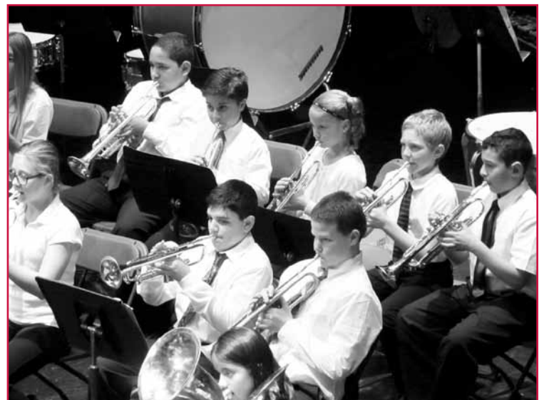
Strong music programs at RCK (pictured) and JFK sent eight musicians to the SCMEA All-County Festival.

Eight outstanding elementary musicians from JFK and RCK were selected for the SCMEA All-County Festival .