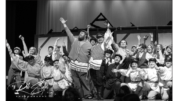
JHS students during their performance of this year's school musical, Fiddler on the Roof.