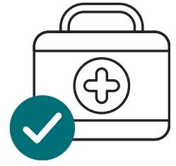
Medically Necessary Items