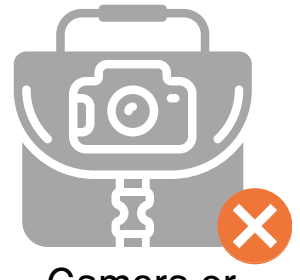
Camera or Computer Bags