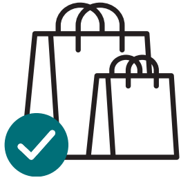
Clear Plastic or Vinyl Bags