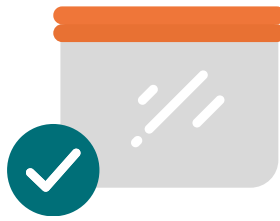
Clear Plastic Ziploc-style Bags