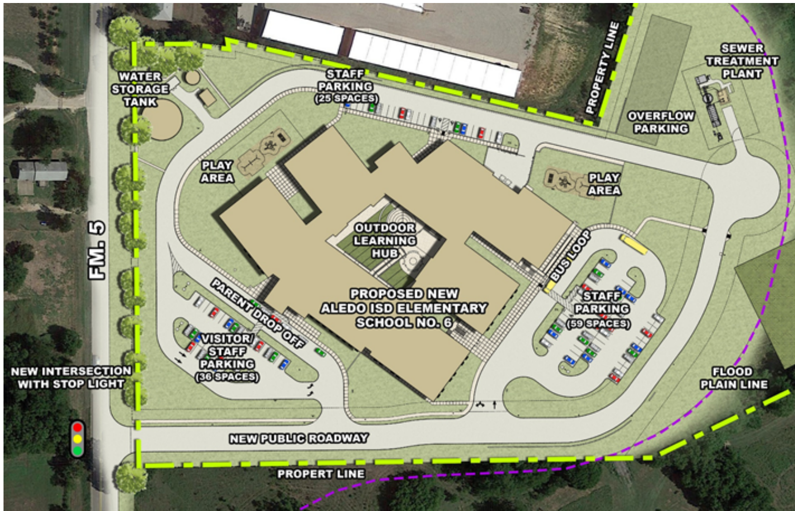
Enlarged Composite Site Plan