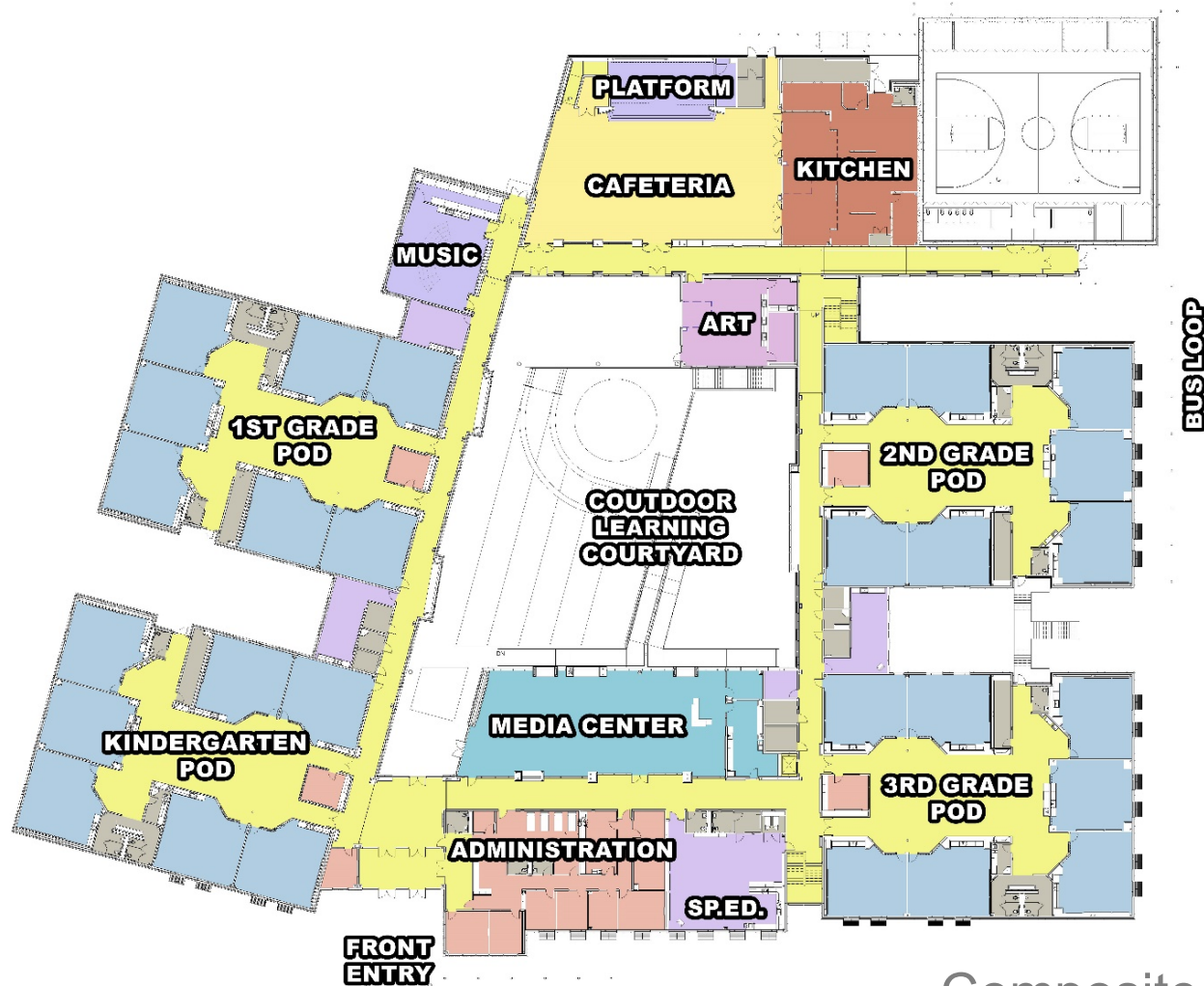
Composite First Level – Floor Plan