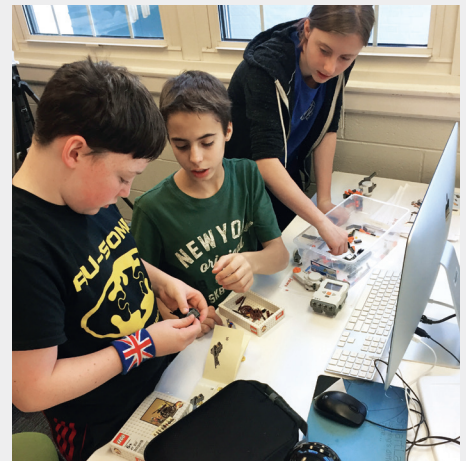
Students work in collaborative teams as part of the focus on STEM.