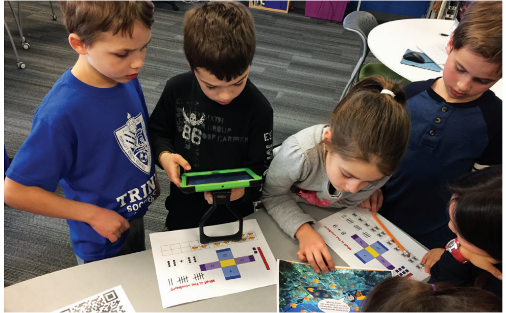
There is a dual focus within the instructional program at Bannockburn School that includes both academics and community service.