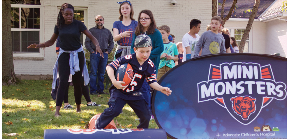
Students participate in Fuel Up to Play 60 activities that promote an active and healthy lifestyle.

"...We continue to see our student population bringing healthier snacks and bringing in healthier options for lunch."